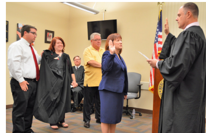
Honorable Judge Donald Proietti, Presiding Judge, provided opening remarks and administered Judge Seymour's oath of office.